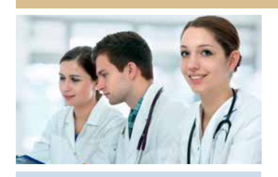
TABLE OF CONTENTS EXHIBIT A